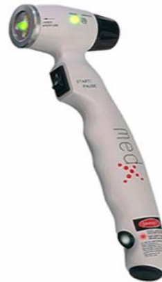
Portable low level laser

Laser therapy is a form of therapy that can work on patients of any age and injury. We look forward to your speedy recovery with help from our low-level laser. Talk to your chiropractor if you have any additional questions about laser therapy.